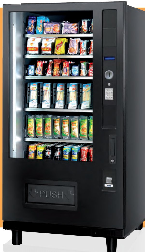
G-Snack Plus 8 Master