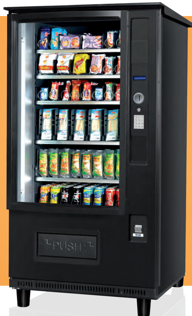
G-Snack HS 8 OUTDOOR