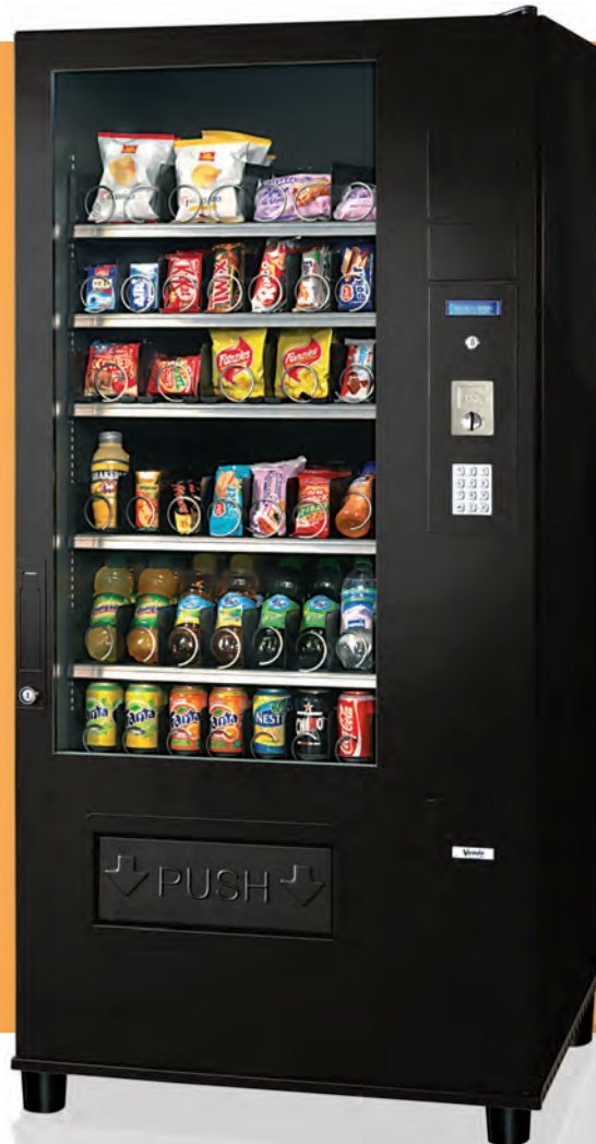
G-Snack Budget Master 8