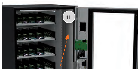
Products can be stored in pre-cooling area